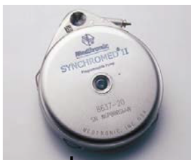
Intrathecal pump and programmer